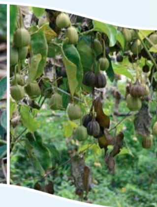
馬兜鈴 Pipevine ( Aristolochia spp. )