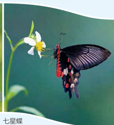
七星蝶 Common rose ( Pachliopta aristolochiae )