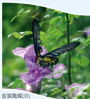
金裳鳳蝶(III) Golden birdwing(III) ( Troides aeacus )