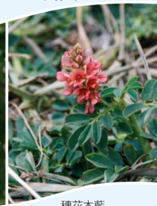
穗花木藍 Creeping indigo ( Indigofera spicata )