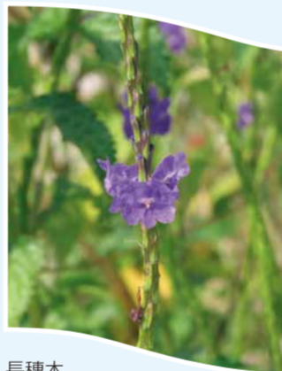
長穗木 Jamaica vervain ( Stachytarpheta jamaicensis )