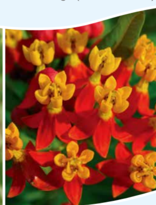
馬利筋 Blood-flower milkweed ( Asclepias curassavica )