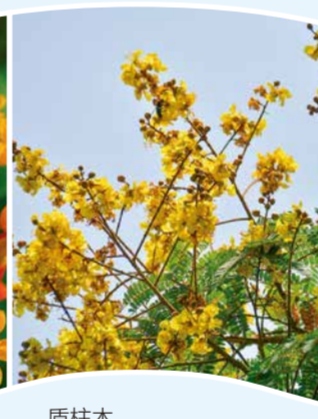
盾柱木 Yellow flametree ( Peltophorum pterocarpum )