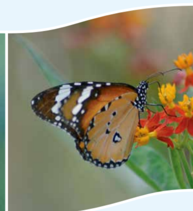
金斑蝶 Plain tiger ( Danaus chrysipus )