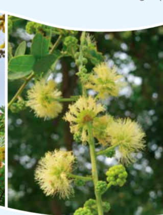
金龜樹 Manila tamarind ( Pithecellobium dulce )