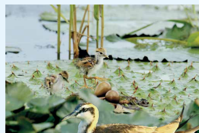
↑ 水雉雛鳥 (upper) Juvenile Jacana

Until today, there are about 10 jacanas steadily brooding, breeding and nesting in Zhouzai wetland. However, due to the limited area and lack of water fields nearby, the growing number of jacanas is confined by the carrying capacity. Consequently, new generations spread out of Zhouzai Wetland to other wetlands nearby. That is why traces of jacanas can also be found in Yuanzhonggang Wetland, Niasong Wetland, and Dashu Old Bridge Wetland.