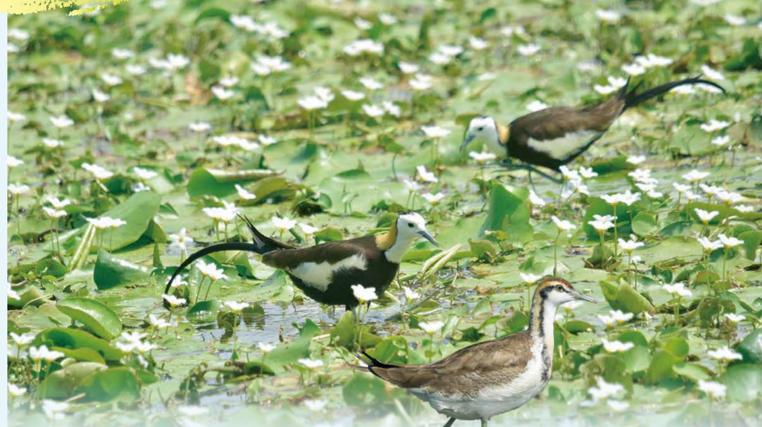
↑ 夏羽水雉 (upper) Jacana in breeding plumage