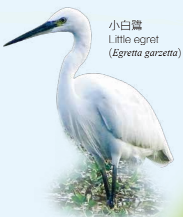
小白鷺 Little egret ( Egretta garzetta )

(註) 保育類動物等級：I代表瀕臨絕種野生動物、II代表珍貴稀有野生動物、III代表其他應予保育之野生動物