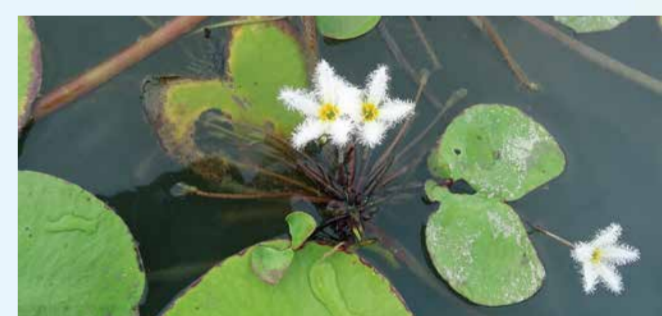
印度苔菜 Water snowflake ( Nymphoides indica )

1989年因水雉族群瀕危，由農委會公告為珍貴稀有(II)保育類動物，2005年夏季洲仔濕地闢建工程完成後，1對水雉於此成功繁殖4隻幼雛，不僅顯示「水雉返鄉計畫」的成功，也是都會濕地生態的奇蹟。至今，約有10隻穩定的水雉族群持續在此築巢、繁殖及育雛等，然而，由於洲仔濕地水域面積有限，加上周邊缺乏農田支持環境，水雉族群數量侷限於環境承載限制，繁衍後的下一代往往向周邊區域濕地擴散，包括援中港濕地、鳥松濕地及大樹舊鐵橋濕地等，都可見到凌波仙子的芳蹤。