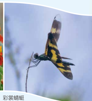
彩裳蜻蛉 Variegated flutterer ( Rhyothemis variegata )