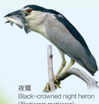
夜鷺 Black-crowned night heron ( Nycticorax nycticorax )