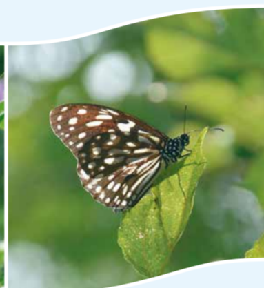
淡紋青斑蝶 Blue tiger ( Tirumala limniace )