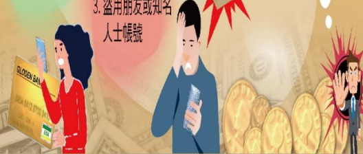
內政部移民署 新住民發展基金補助 廣告