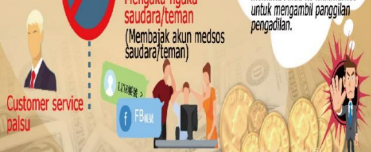
Ministry of the Interior National Immigration Agency / The New Immigrants Development Fund AD