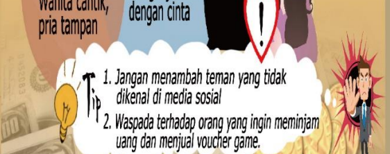
Ministry of the Interior National Immigration Agency / The New Immigrants Development Fund AD