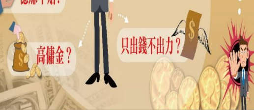
內政部移民署 新住民發展基金補助 廣告