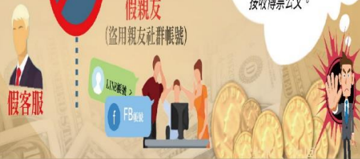
內政部移民署 新住民發展基金補助 廣告